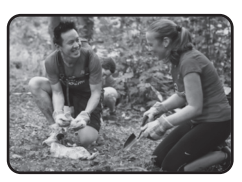
GoodGym runners carrying out a mission